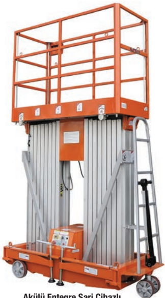
Akülü Entegre Şarj Cihazlı

NL-DMAP 6.0 : 8 m NL-DMAP 8.0 : 10 m NL-DMAP 10.0 : 12 m NL-DMAP 12.0 : 14 m NL-DMAP 14.0 : 16 m